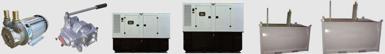
Auto filling fuel pump