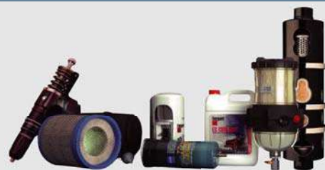
500 hours genset spare parts